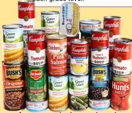
Any non-expired canned goods